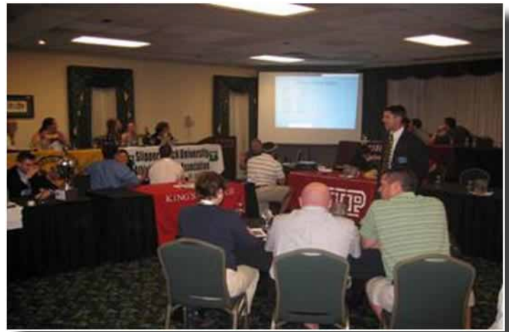
Past Quiz Bowl

Dear Program Directors and ATEP Faculty; It's time again to start preparing your school's best and brightest to determine the 2010 PATS Quiz Bowl Champions!!! Can 2009 Champions, Indiana University of Pennsylvania, repeat, or will a past Quiz Bowl winner like Lock Haven University or Slippery Rock University return as champions, or will a new Quiz Bowl champion emerge? Please encourage your students to put a team together teams of three for this always fun and memorable event.