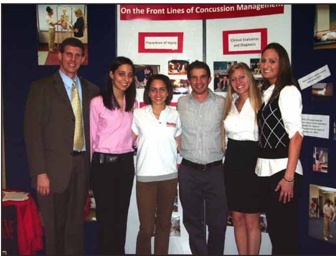
Duquesne University Athletic Training Students