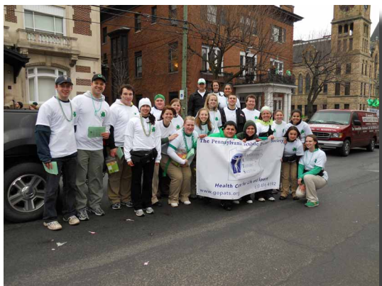
St. Patrick's Day Parade

The PATS PR committee also sponsored a float in the St. Patrick's Day parade, in Scranton, PA for the second consecutive year. This parade is the second largest parade in the United States, having more than 100,000 spectators and 12,000 participants. This year's theme for the float was "Keep Your Brain in the Game". With the combined help and support of the students and faculty from East Stroudsburg University and King's College ATEP's and Department of Athletics', we were able to promote March being both National Athletic Training Month and National Brain Injury Awareness month, as well as promoting the significance of reporting the signs and symptoms of brain injuries to an Athletic Trainer, or Physician. The groups designed an interactive float with an Athletic Trainer performing a concussion evaluation on an "injured" athlete. They also handed out an education pamphlet on concussion to parents, PATS plastic cups, a t-shirt that read "PATS wants to help you Keep Your Brain in the Game", and other