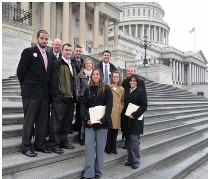
Athletic Trainers and athletic training students for Hit the Hill Day

Pennsylvania athletic trainers and athletic training students gathered in Washington, D.C. to participate in NATA's Capitol Hill Day 2010 on February 23, 2010. The Pennsylvania representatives teamed together to attend many meetings with legislators in the US House and Senate and used their time to ask for their support for HR 1137 and seek possible Senate sponsorship and introduction. The time was also spent informing and educating legislators about the profession of athletic training, answering questions about the profession and HR 1137, and offering athletic trainers as a resource for future sports health issues. Next year, we all hope you will find time to attend!